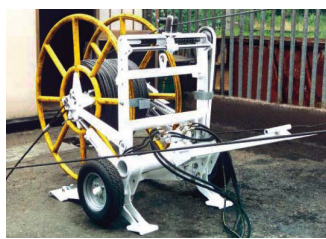
Hydraulic reel winders