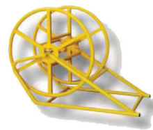
Cradle reel elevator