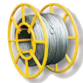
Antitwisting steel rope