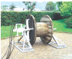
Hydraulic reel elevator