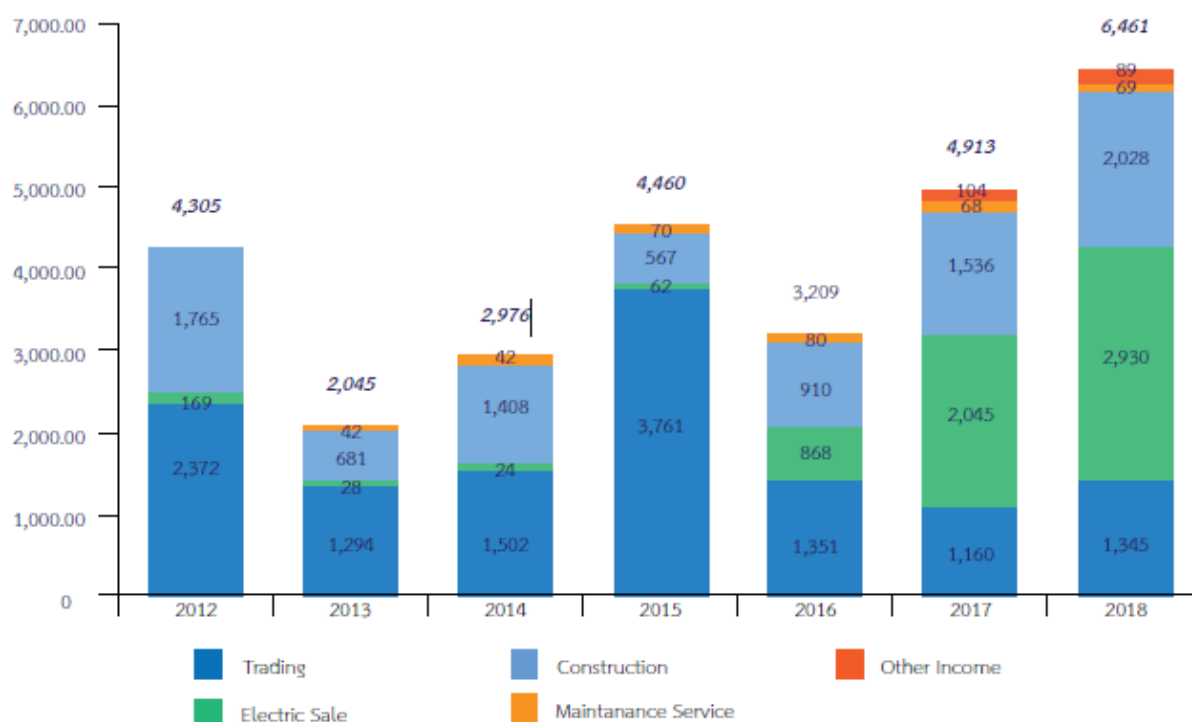
Revenue Breakdown by Business as of 31 Dec 2018 (Unit: Million Baht)